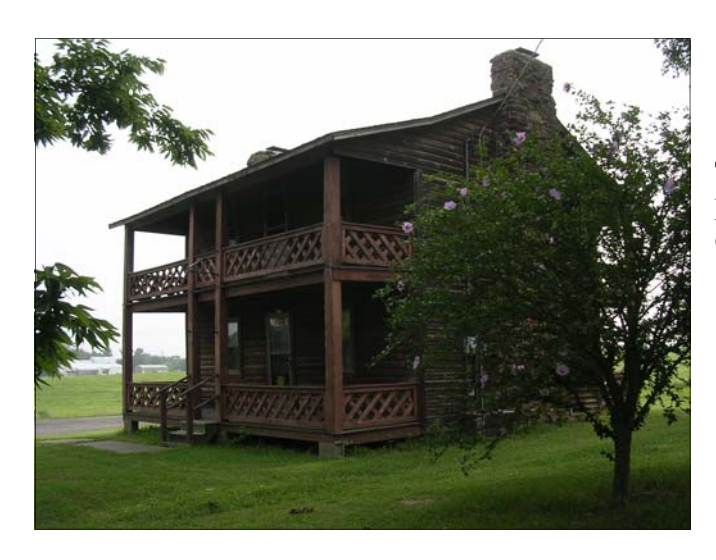
The Silkwood Inn Mulkeytown, Illinois

The writing on the shapeless low sandstone that is Priscilla's marker has worn away and is nearly illegible: